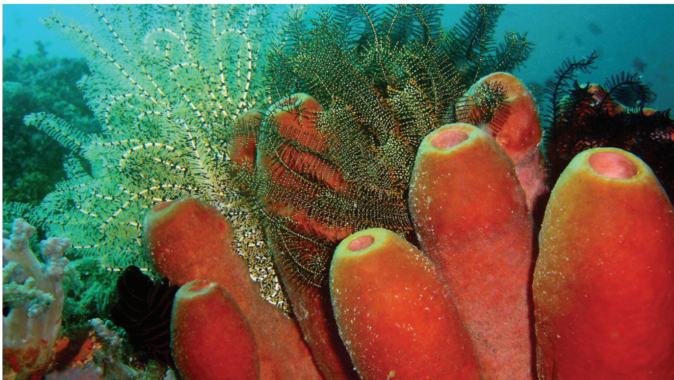
GUIDO &amp; PHILIPPE POPPE - WWW.POPPE-IMAGES.COM

Tomorrow's antibiotics might arise from unexpected sources, including this sponge, Theonella swinhoei .